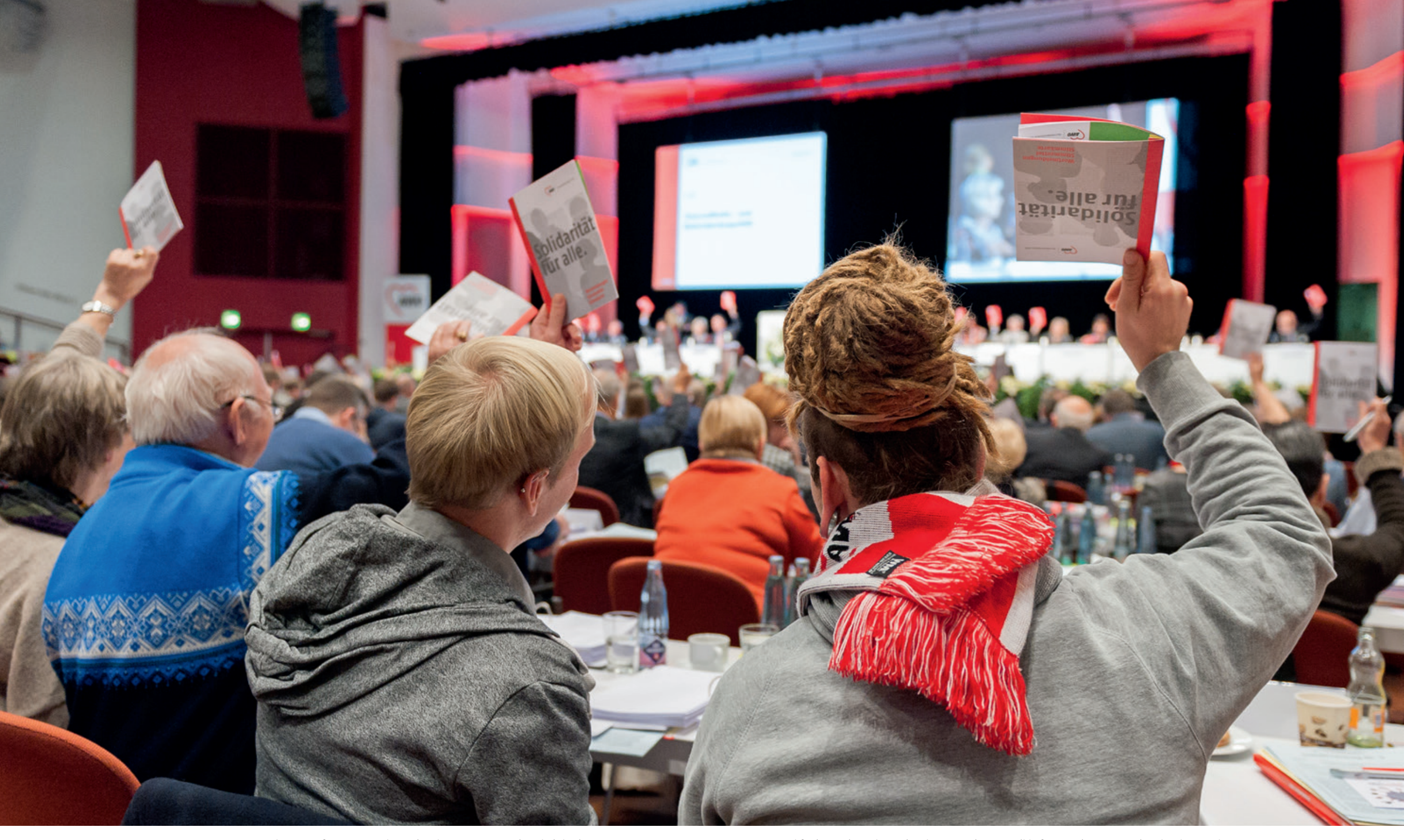
THE NATIONAL CONGRESS — AWO meets together every four years at the national congress to monitor their basic principles in terms of social issues, specialist areas and association policies. Current and future challenges are discussed. The numerous course-setting resolutions provide the guidelines for the work of the association and its facilities,