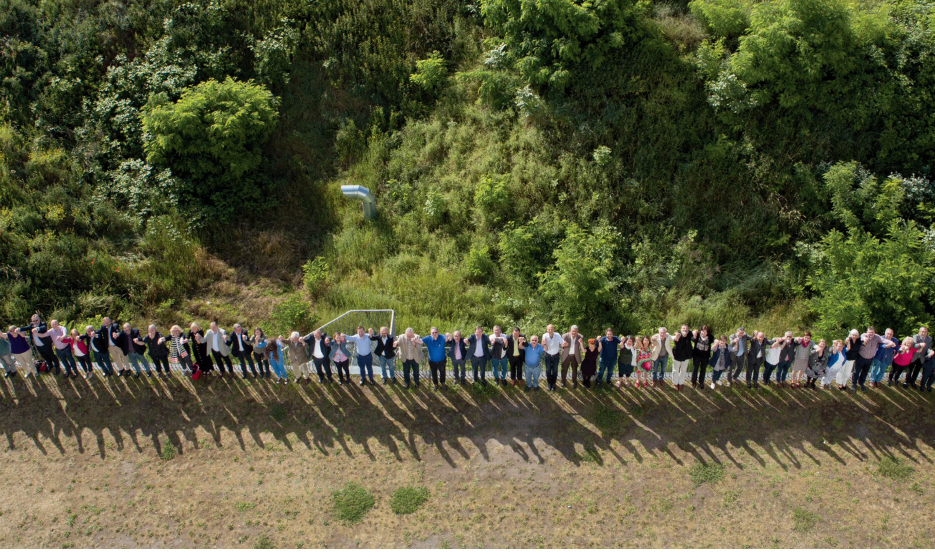
THE AWO CAMPAIGN WEEK "GENUINE COMMITMENT. GENUINE DIVERSITY. GENUINE AWO." — We are many and we act. Commitment is firmly rooted in the history of AWO. With this in mind, AWO and its youth section organise a campaign week every year.