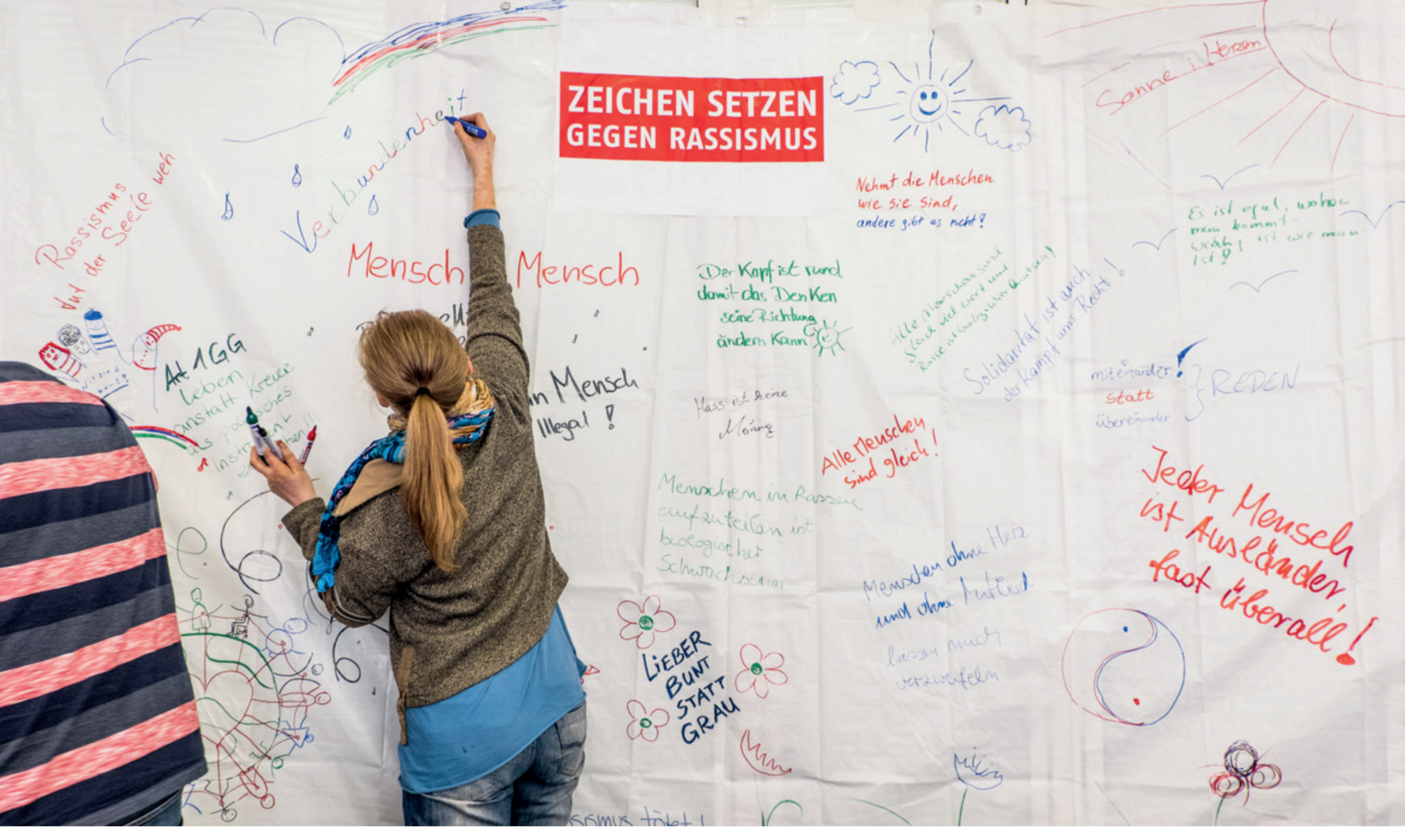
AWO AGAINST RACISM, AWO FOR DIVERSITY — AWO was banned from 1933 to 1945. Based on this fact alone, we know only too well what racism, antisemitism, ostracism and contempt for human beings lead to – a society that is not free, not social and not equal. Our work involves vigorously opposing this.