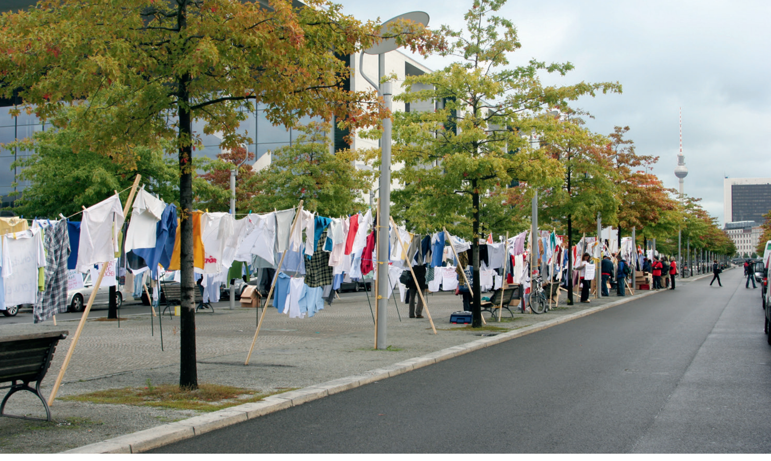
GIVING THE SHIRT OFF ONE'S BACK — In political initiatives, campaigns and demonstrations, we communicate our stance publicly and fight for solidarity, tolerance, freedom, equality and justice. For a society in which all people have the same opportunities.