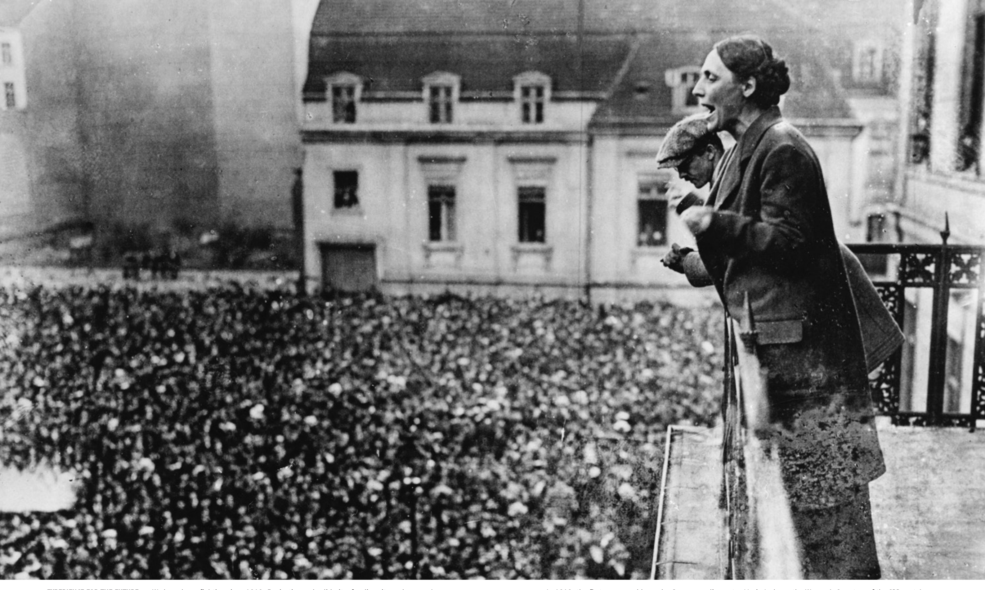
EXPERIENCE FOR THE FUTURE — We have been fighting since 1919. For justice and solidarity, for diversity and women's rights. For a dignified life, in which no one is given alms but everyone has the opportunity to be a part. As it is only in this way that genuine integration is achieved.