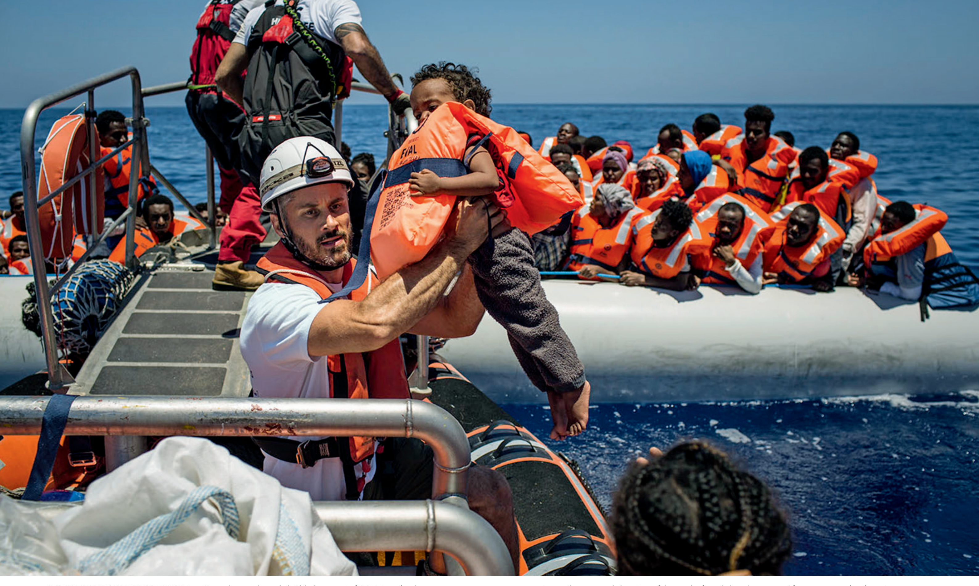
CIVILIAN SEA RESCUE IN THE MEDITERRANEAN — We are desperately needed. With the support of AWO International, the team of SOS MEDITERRANEE's rescue ship Ocean Viking saves lives week after week. The figures show how desperately needed the missions are.