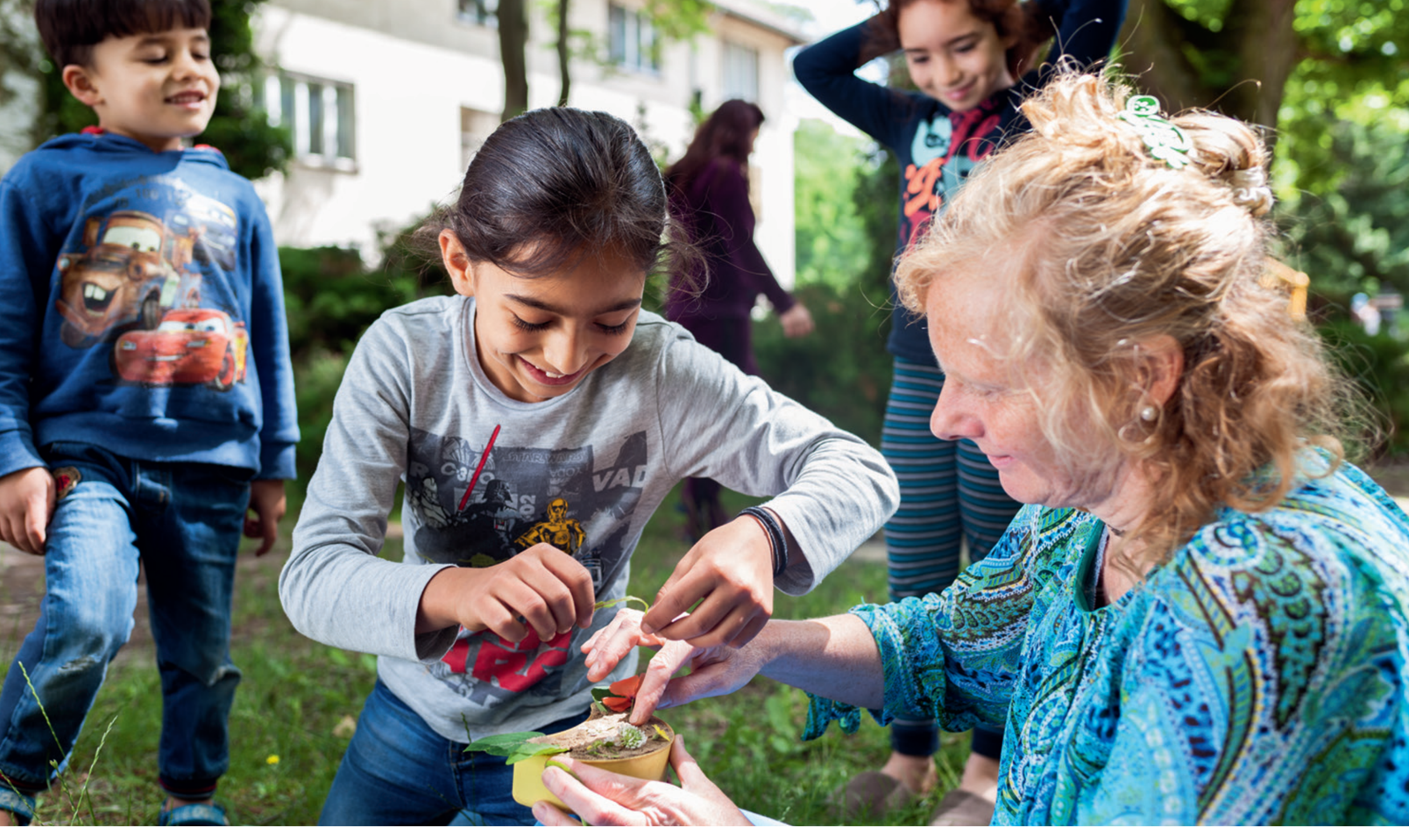
BECAUSE WHAT UNITES US IS GREATER THAN WHAT DIVIDES US — With our voluntary work, we help, for example, refugees to be able to organise their everyday lives in Germany for themselves. Our goal is for them to be a part of social life on an equal footing.